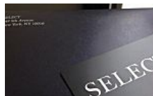
The Black Card That's Changing the Face of