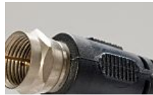
3 Companies Putting Big Cable Out Of