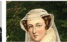
Do You Have Royal Blood? Your Last Name